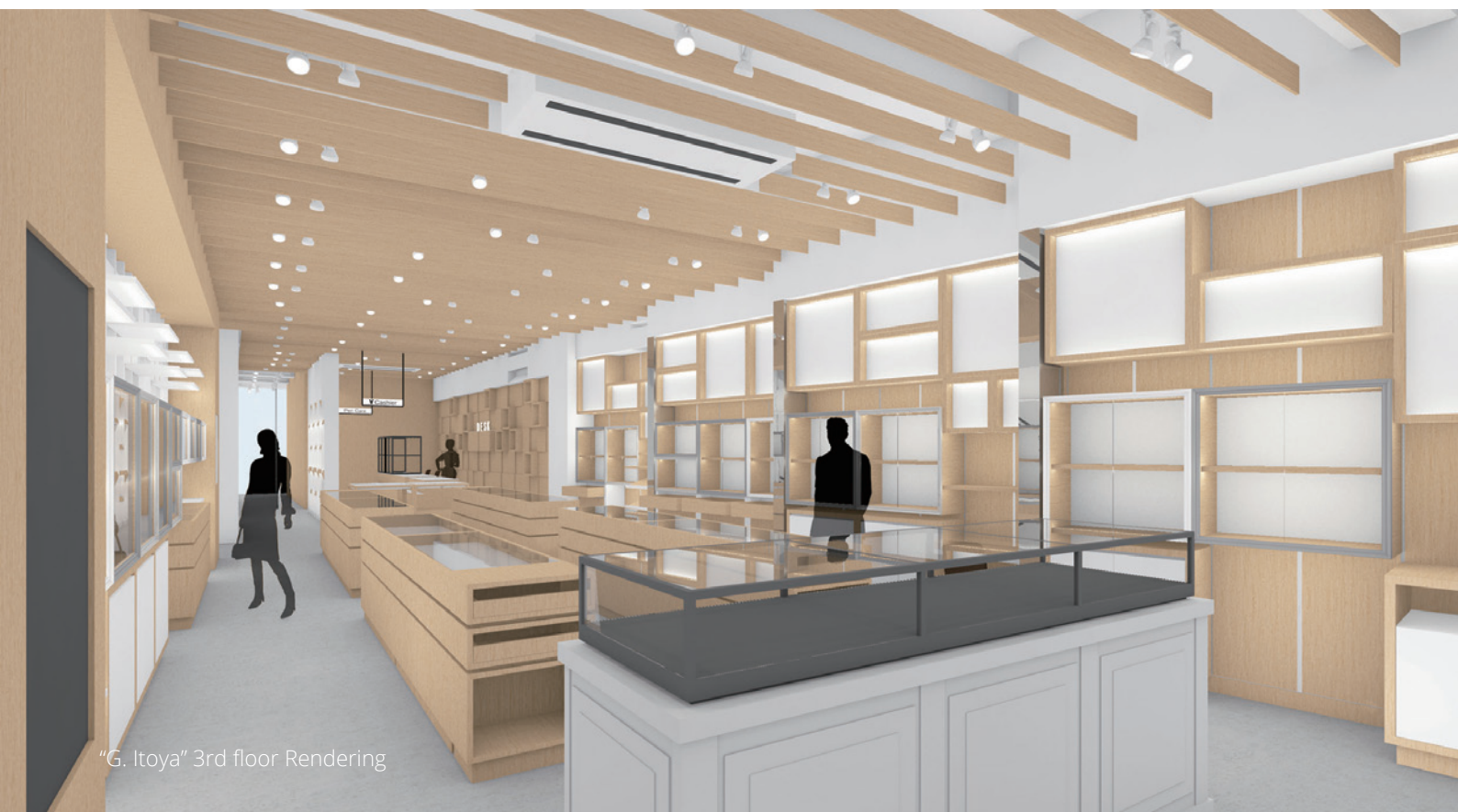
"G. Itoya" 3rd floor Rendering