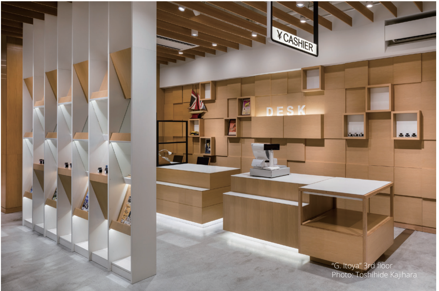
"G. Itoya" 3rd floor