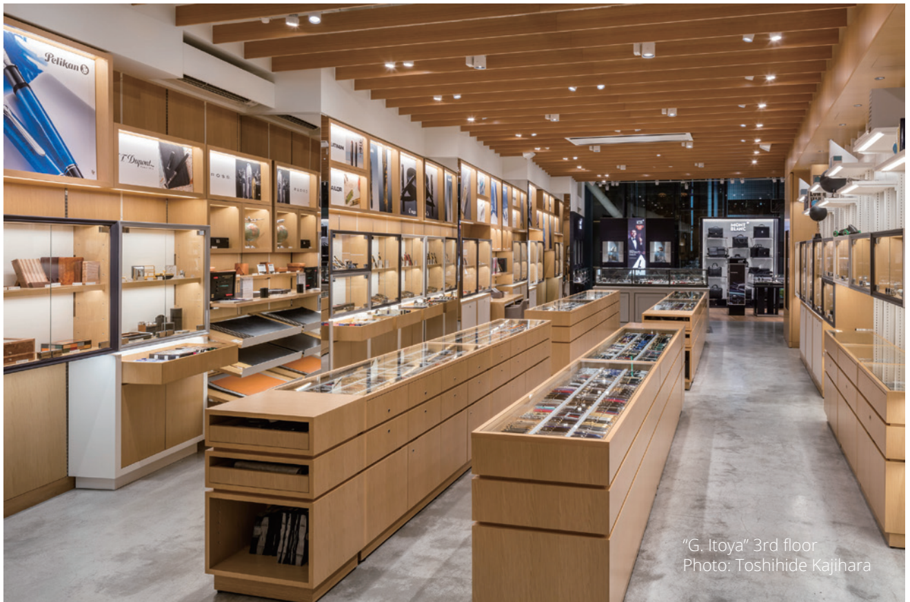
“G. Itoya” 3rd floor

In this phase, the firm creates a design that includes more detailed visuals than just 2D drawings by including texture and materials, so the clients understand more clearly the proposed design content in the early stage. Ikeda Architecture strives to implement this DD workflow in most of their projects. In addition to the 2D drawings, the firm provides renderings; they also add the actual colors and textures of the materials on the floor plan to visualize the design in a more comprehensive way for the client.